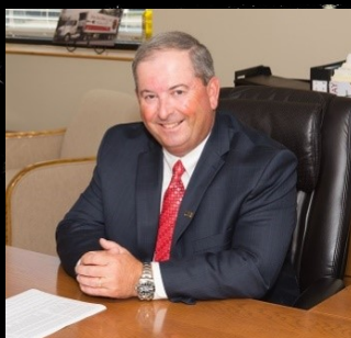
PERFORMANCE Foodservice – NorthCenter