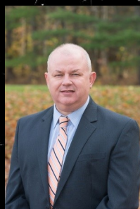
Jobs for Maine's Graduates