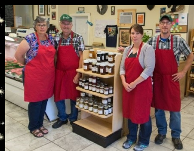
Emery's Meat & Produce