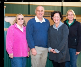
Snow Pond Center for the Arts