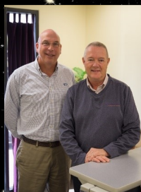
Premier Marketing Group