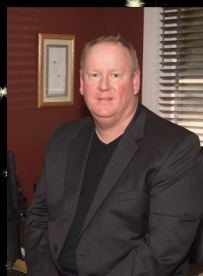
Maine Technology Group