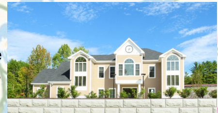
85 Civic Center Dr., Augusta

To RSVP contact the Kennebec Valley Chamber of Commerce by calling (207) 623-4559 or by emailing info@kennebecvalleychamber.com