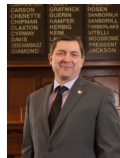
Troy Jackson Senate President

129th Maine State Legislature Update From the Senate President