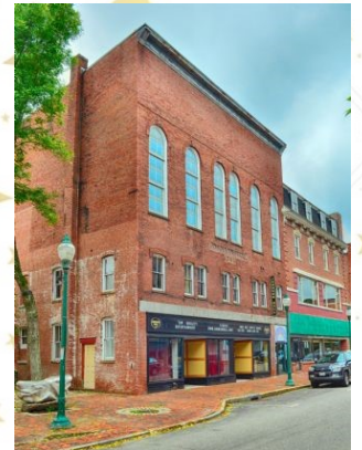
280 Water Street, Gardiner

Every Business After Hours is an incredible opportunity to win amazing door prizes and take part in the 50/50 raffle.