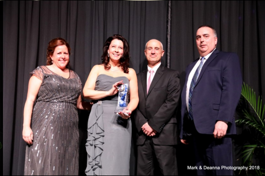
Small Business of the Year Capital Area Staffing Solutions