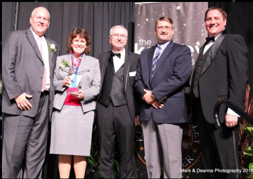
President's Choice Thomas College