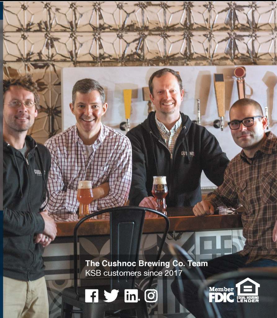
The Cushnoc Brewing Co. Team KSB customers since 2017